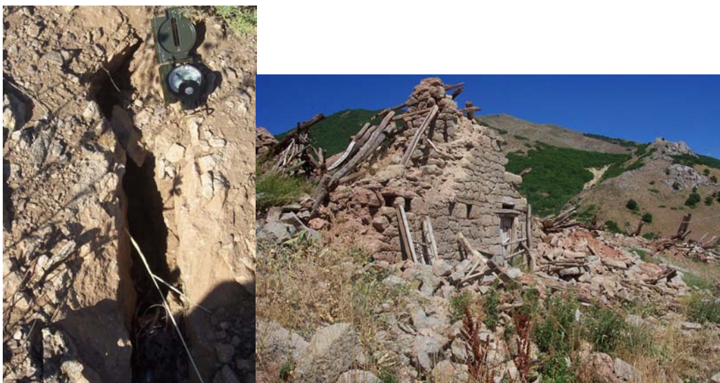
Figure 2. Fault trace and a sample of traditional village house damaged by earthquake

The preliminary field observation undertaken by Seismology Team. The hypocentral location of the 2003 Pülümür earthquake is about 4.5 km W-SW distance of the Sağlamtaş village. This region located between Hor brook and Sal brook (Kalafat et al., 2003).