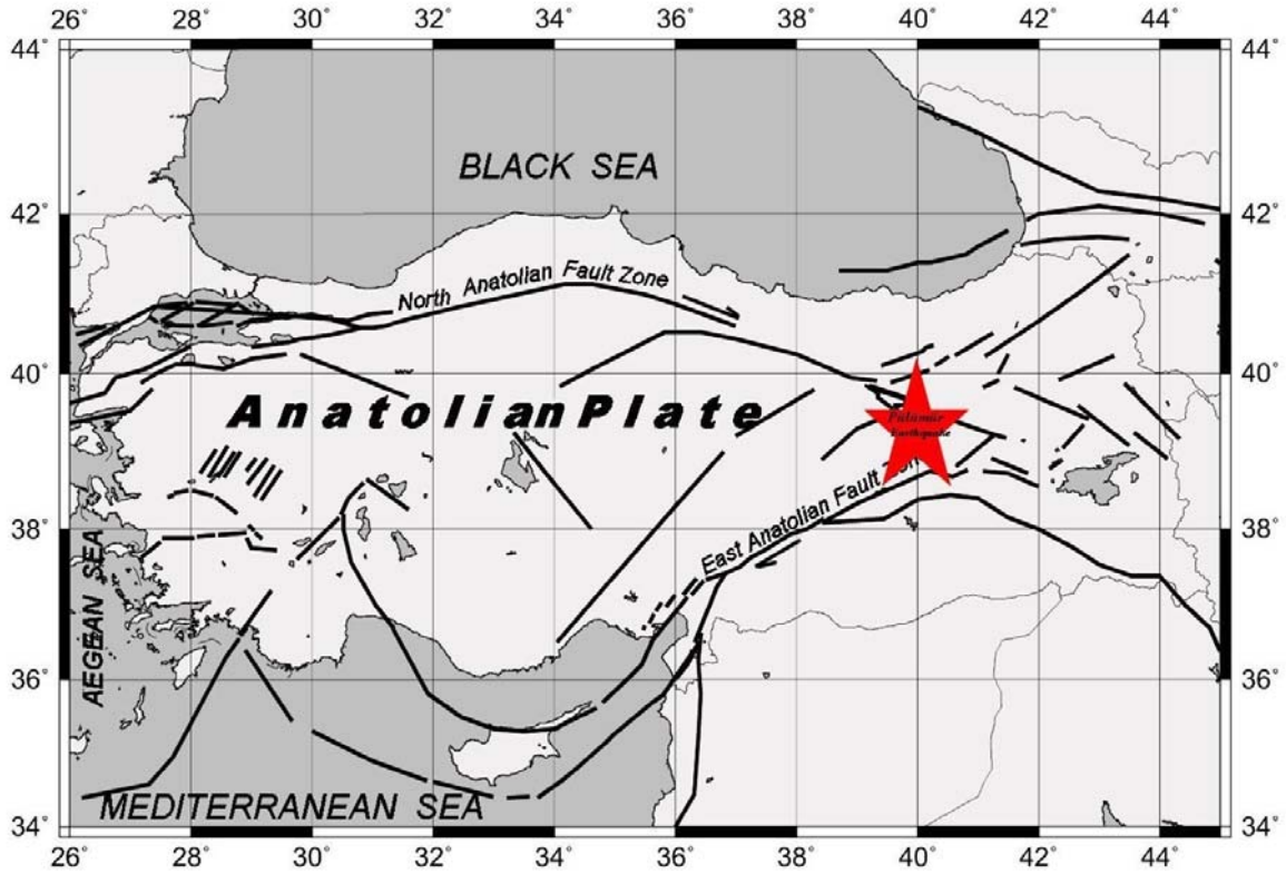
Figure 1. General tectonic setting of Turkey and Pülümür Earthquake location